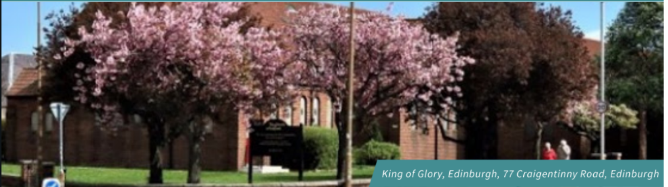
King of Glory, Edinburgh, 77 Craigentinny Road, Edinburgh